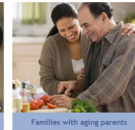
Families with aging parents